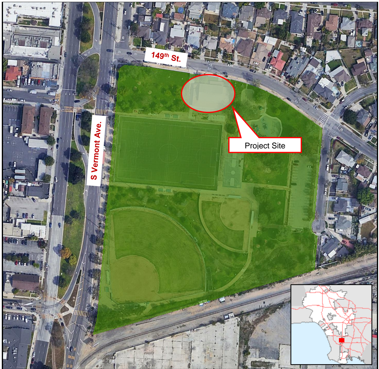
Figure 1. Project Location